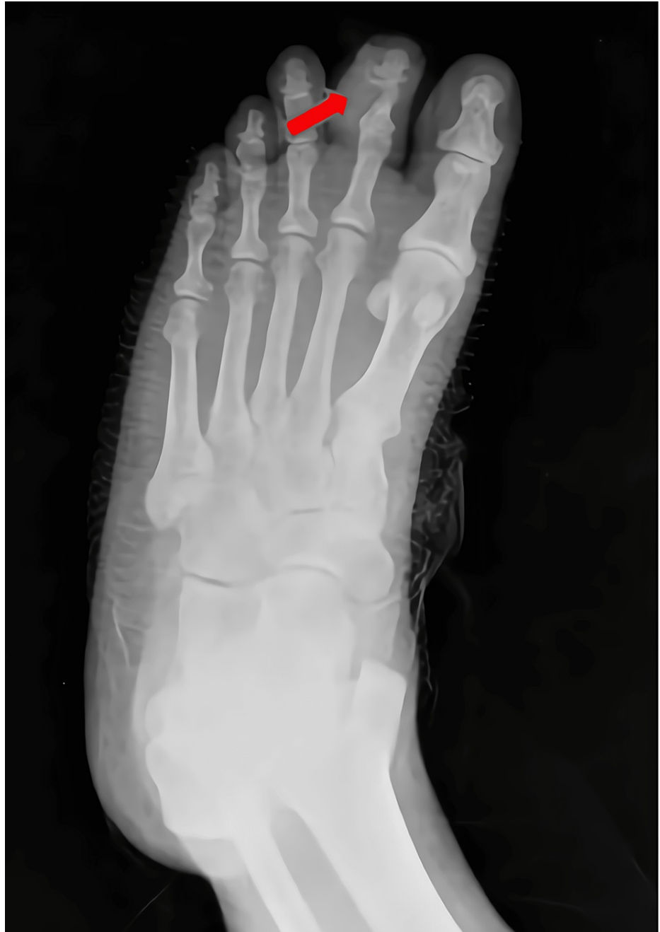
FIGURE 3: Postoperative X-ray image.

Histopathology of the excised lesion showed that the mass was covered by a thin fibrous capsule in most areas. In cross-sections, immature irregular bone trabeculae surrounded by active osteoblasts were observed in a loose fibrous stroma consisting of spindle cells. One-half of the lesion showed an island consisting of chondrocytes with enlarged nuclei and binucleation was observed (Figure 4).