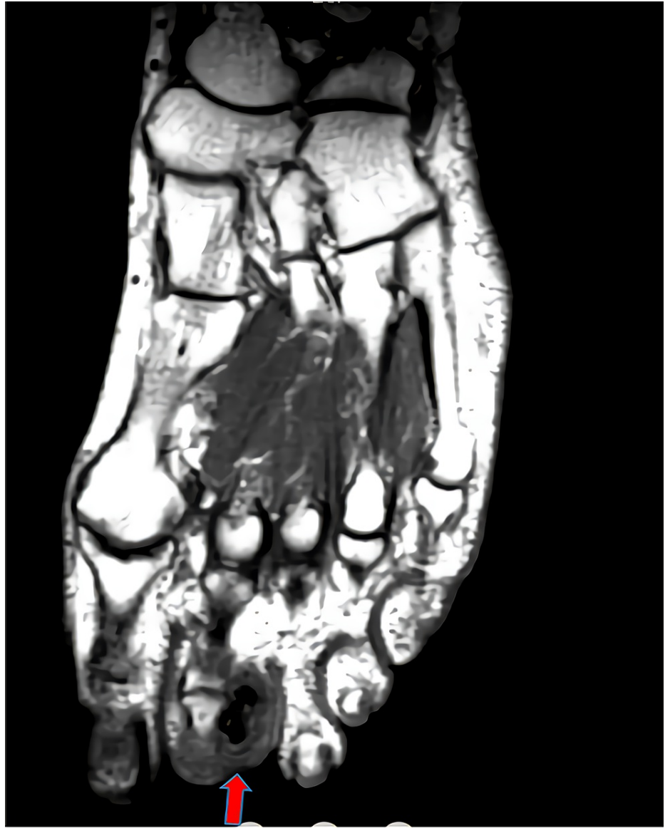
FIGURE 2: A hypointense lesion was seen on MRI.

An excisional biopsy of the lesion was carried out with clear margins. The neurovascular structures were preserved. A small part of the cortex was excised as part of the planned margin, bearing in mind the possibility of parosteal osteosarcoma or periosteal chondrosarcoma. A postoperative X-ray image is shown in Figure 3.