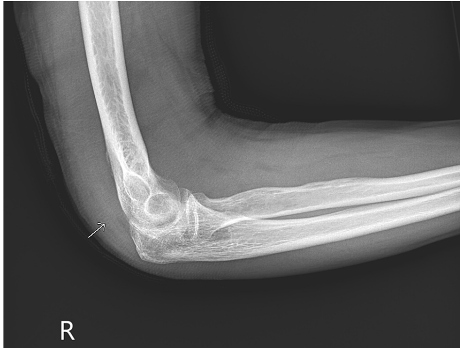
FIGURE 1: X-ray of the right elbow.

with a subjacent complex rim-enhancing fluid collection with intraosseous penetration of this complex collection with associated erosion involving the lateral tubercle of the posterior talar process. Focally pronounced surrounding bone marrow edema was noted throughout the talus amidst a background of diffuse periarticular hyperemia/osteopenia throughout the ankle, hindfoot, and midfoot, with associated small effusions and synovitis of the ankle and posterior subtalar joints (Figure 4).