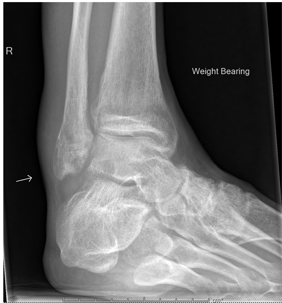
FIGURE 2: X-ray of the right ankle.

Marked soft tissue swelling around the right ankle with marked periarticular osteopenia. There is also a lobulated soft tissue density projecting dorsally to the ankle joint into Kager's fat pad. There is preservation of the joint space width.