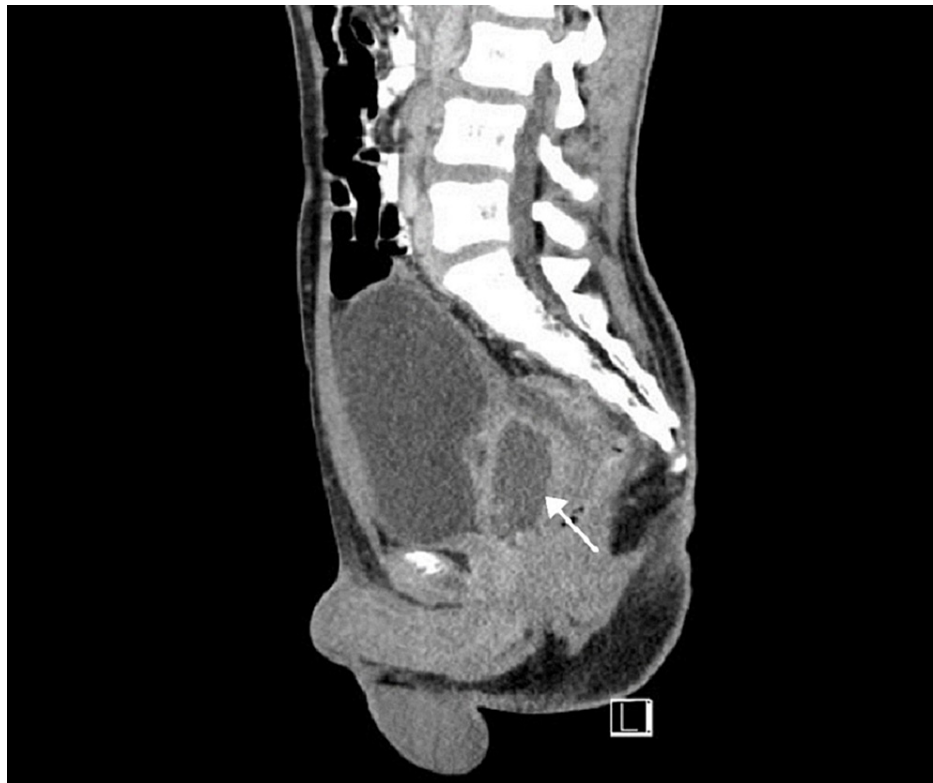
FIGURE 3: Computed tomography (sagittal view) revealing cystic lesion compressing on the posterior bladder wall

We performed an ultrasound-guided aspiration that released bloody pus. A cytology investigation showed mostly neutrophils with no malignant cells. The prostatic abscess diagnosis was confirmed. The patient was kept on ceftriaxone and clindamycin antibiotics. He improved gradually but started to have bloody discharge from the urethra even with the improvement of other symptoms. Later, however, all his symptoms improved, and he was doing well as of this writing.