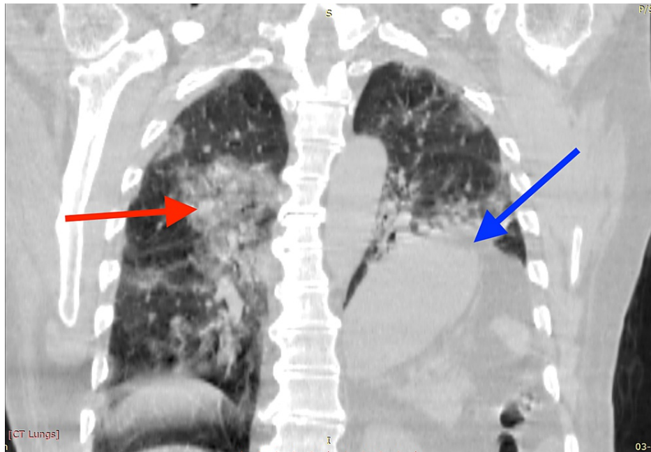
FIGURE 3: Coronal section chest HRCT showing bilateral multifocal peripheral ground glass opacities (red arrow) with a raised left hemidiaphragm (blue arrow)

COVID-19 pneumonia was diagnosed on the basis of a positive COVID-19 RT-PCR, HRCT CTSS of 19/40, and CO-RADS score of 6. The patient was shifted to the COVID medical ward, given his regular cardiac medications, and started on oral azithromycin 500 mg once daily, intravenous dexamethasone (with tight glucose monitoring) 6 mg once daily, prophylactic anticoagulation with subcutaneous low-molecular-weight heparin (LMWH) injection at 60 mg once daily, oral atorvastatin 20 mg once daily, insulin according to sliding scale, and injection remdesivir given as a 200 mg loading dose, followed by 100 mg daily for four days. The patient's clinical condition improved after eight days with improvement in oxygen saturation to 97% on room air. He was discharged on day 14 and advised chest physiotherapy and incentive spirometry along with pulmonology clinic follow-up.