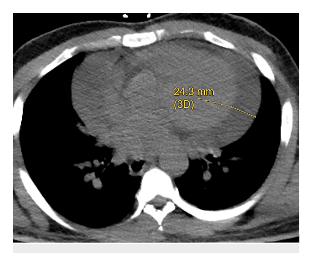
FIGURE 2: Computed Tomography Chest

Pericardial effusion of 24.3 mm (3D) shown on computed tomography chest imaging. D: dimension.