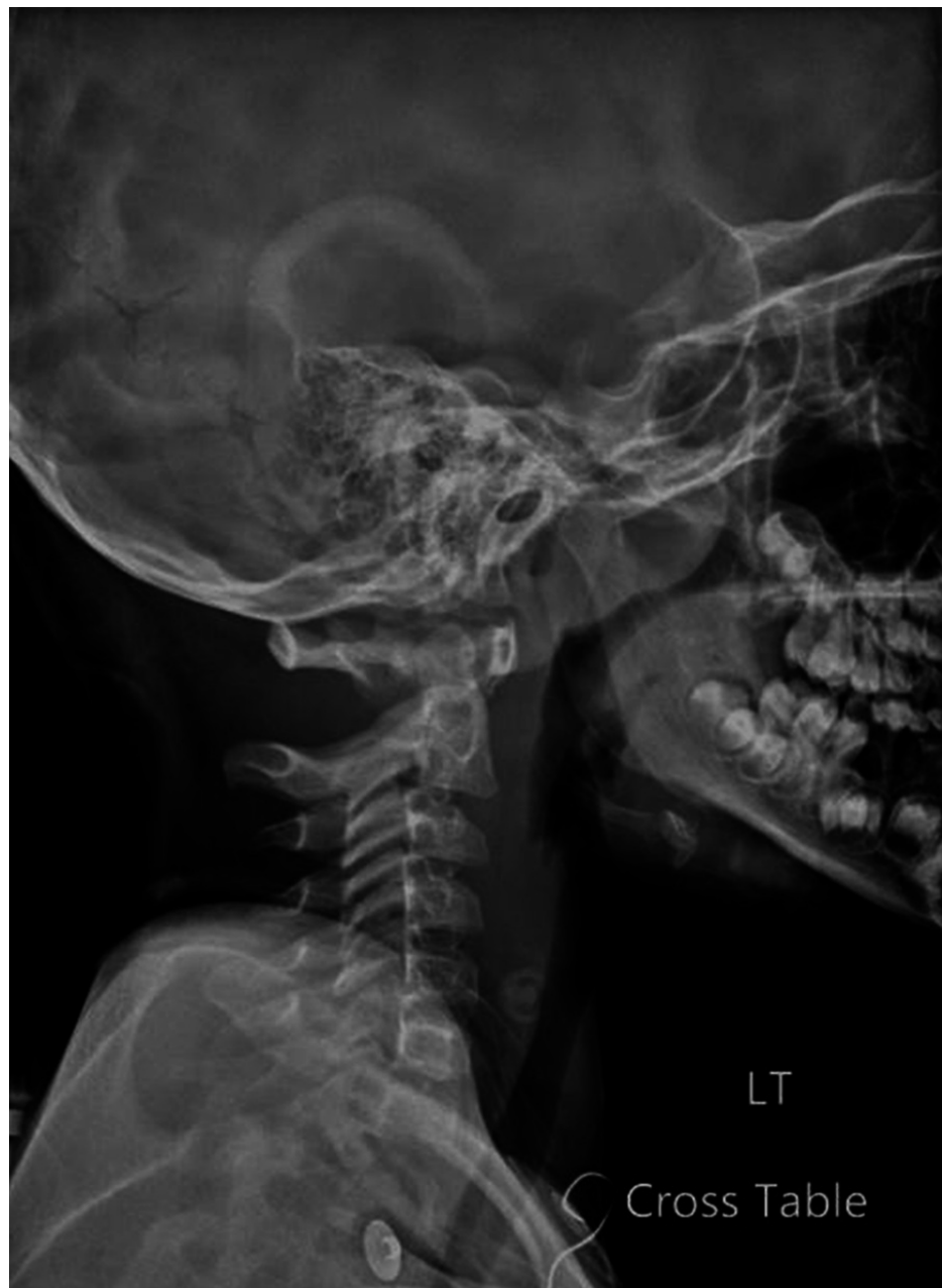
FIGURE 2: Lateral X-ray of the cervical spine revealing mild anterolisthesis of C2 on C3.

Subsequently, she underwent an emergent exploratory laparotomy where she had small bowel perforations, cecal perforations and a deserosalized ileum. Small bowel resection, right hemicolectomy and an ileo-ileal anastomosis were performed to repair her enteric injuries. She tolerated the surgery well and was moved to the pediatric intensive care unit (PICU) where an orthopedic consult was requested for her spinal injuries.