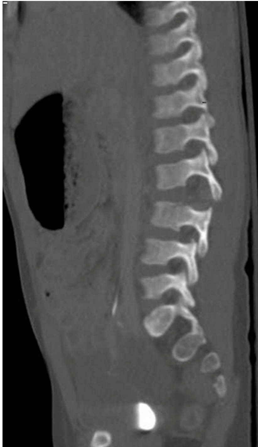
FIGURE 1: Sagittal CT scan with contrast of the lumbar spine right of midline. There is angulation at the L2-3 level with widening of the posterior intervertebral disc space and the spinous processes, findings consistent with ligamentous injury. Fracture was not detected in this series.

Physical examination found her to have a large abrasion on her right forehead, ecchymosis across her abdomen (seat-belt sign) with abrasions, swollen left lower leg, as well as tender and swollen lumbar spine with marked kyphosis. Focused assessment with sonography for trauma (FAST) and computed tomography (CT) revealed: a non-distended tender abdomen, intraperitoneal fluid, closed left distal tibia fracture, Chance-type flexion-distraction lumbar injury with a L2-3 perched facet (Figure 1) and anterolisthesis of C2 on C3 (Figure 2). Her CT was negative for intra-cranial bleeds or fractures.