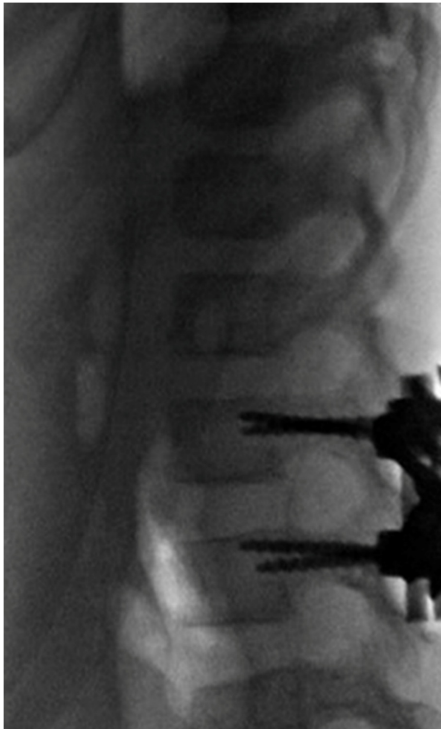
FIGURE 5: Intraoperative X-ray showing internal fixation and reduction of the facet joint at L2-L3.

The patient remained in the hospital for 16 days. She was sent home in a pinless halo for the cervical spine injury. At her first follow-up, 26 days after her initial injury, the patient was independently ambulatory and pain free. The patient was last seen at a two year follow-up and is doing well. She is neurologically intact and reports no discomfort in her back or neck.