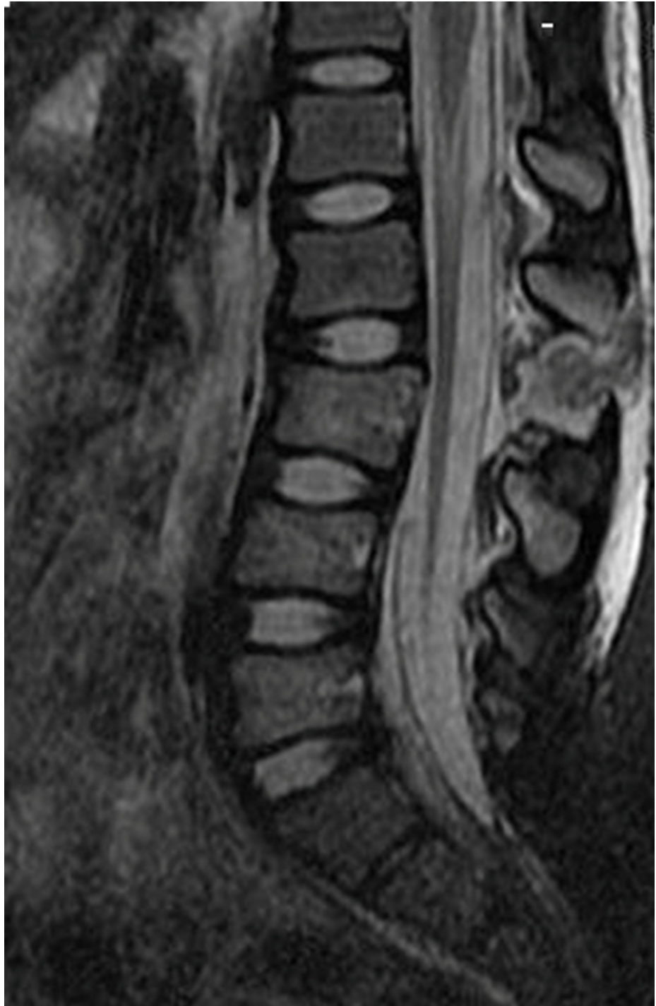
FIGURE 3: T2 weighted MRI of the lumbar spine without contrast revealing a hyperflexion injury with rupture of the interspinous ligaments and ligamentum flavum at the L2-L3. The increased signal intensity is consistent with the formation of a hematoma sac.