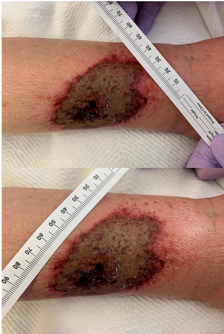
FIGURE 1: Necrotic skin wound.

patient was started on broad-spectrum antibiotics including IV Aztreonam 1 gm Q8 hours, vancomycin 1000 milligrams (mg) once, and clindamycin 600 mg Q8 hours. CT scan of the leg was ordered to rule out necrotizing fasciitis. CT demonstrated diffuse subcutaneous edema with fat stranding, suggestive of cellulitis, but was negative for necrotizing fasciitis or osteomyelitis (Figure 2). A methicillin-resistant Staphylococcus aureus (MRSA) screen and the blood culture were negative. Vancomycin and aztreonam were discontinued, only IV clindamycin was continued. General surgery was consulted for possible wound debridement and recommended local wound care as well as continued antibiotics.