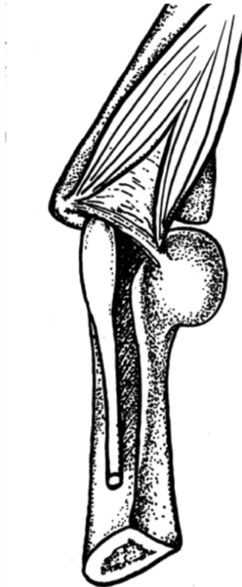
FIGURE 2: Drawing of Osborne's ligament

Note the entrapment site at the postcondylar groove with a pseudoneuroma of the ulnar nerve proximal to the ligament (Published with permission from [5]).