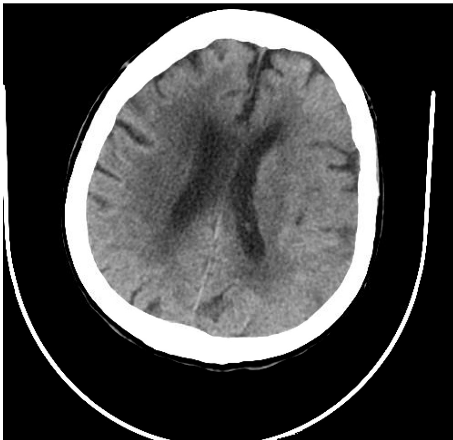
FIGURE 1: CT scan of the head negative for intracranial bleed or acute infarct.

Still, a CT angiogram showed complete occlusion of the M1 branch of the left middle cerebral artery, as shown in Figure 2 .