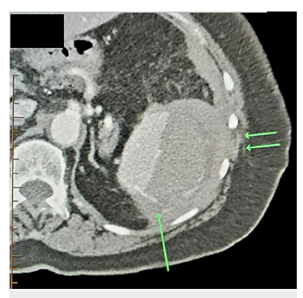
FIGURE 1: CT abdomen/pelvis of the patient's spleen

The image shows active extravasation (single arrow) and hematoma (double arrow)