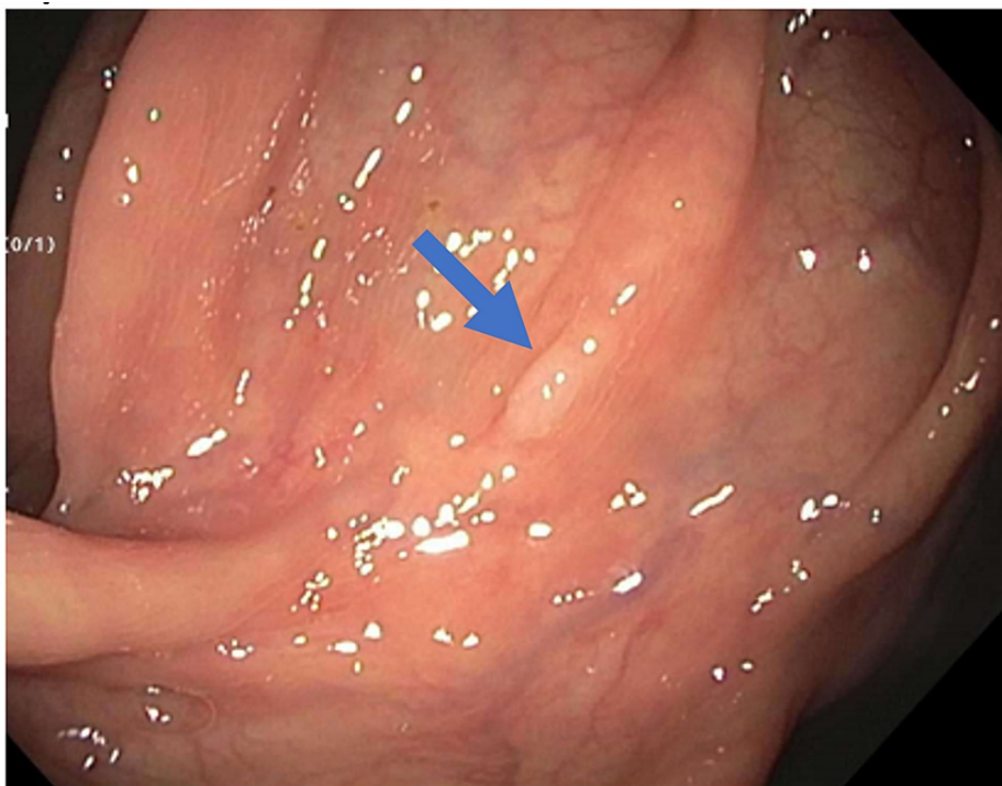
FIGURE 1: Colonoscopy view showing sessile polyp (marked with blue arrow).

Pathology showed hyperplastic polyps and Warthin Starry stain was positive for intestinal spirochetosis (Figure 2).