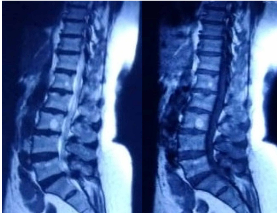
FIGURE 1: MRI of the lumbosacral spine without any significant findings