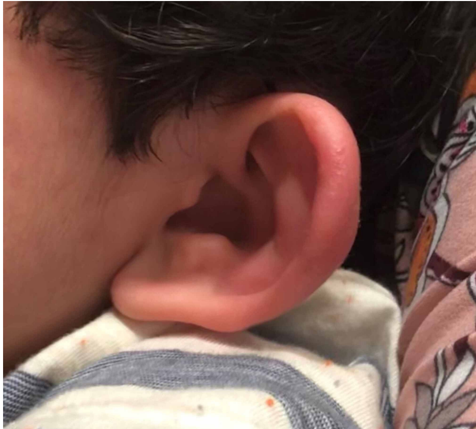
FIGURE 2: View of the anterior aspect of the pinna demonstrating erythema and edema

On palpation, there was tenderness of the auricle, warmth and fluctuant swelling in the affected area. There was sparing of the earlobe and tragus. The mastoid area was not tender or swollen. The ear canal was clear without evidence of otitis externa, and the tympanic membrane was normal. The remainder of the patient's physical exam, including vital signs, was normal.