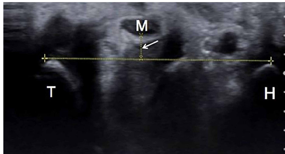
FIGURE 1: Posterior border distance

An experienced radiologist blinded to the patient's history, as well as the results of physical examination and EMG tests performed using a Nicolet EDX (Natus, WI, USA), carried out all US tests using a 6-18 MHz multi-frequency linear array transducer (Toshiba Aplio MX SSA-780A, Tokyo, Japan). Patients were seated with the forearm supinated and the wrist and fingers in a neutral position. The ultrasound probe was positioned perpendicular to the long axis of the forearm, and the cross-sectional area, AP diameter, and transverse diameter of the median nerve were evaluated; AP and transvers diameters were measured at the hamate level. We evaluated the PBD by measuring the length of the perpendicular line between the posterior border of the median nerve and the line between the hook of the hamate and trapezoid tubercle (Figure 1). All measurements were repeated thrice, and median values were recorded. The study was approved by the ethical committee of our university.