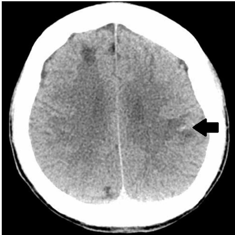
FIGURE 1: Computed tomography of head showing punctate hypointensity in the left temporoparietal region (black arrow)

Electroencephalographic (EEG) testing was normal on presentation. Blood cultures grew Salmonella and methicillin-sensitive Staphylococcus aureus (MSSA), and the patient was started on intravenous ceftriaxone. MSSA was thought of as a skin contaminant, hence not treated. Magnetic resonance imaging (MRI) of the brain was concerning for pus in ventricles with re-demonstration of multiple acute infarcts in bilateral frontal lobes and deep nuclei and a developing abscess in the left parietal lobe (Figure 2).