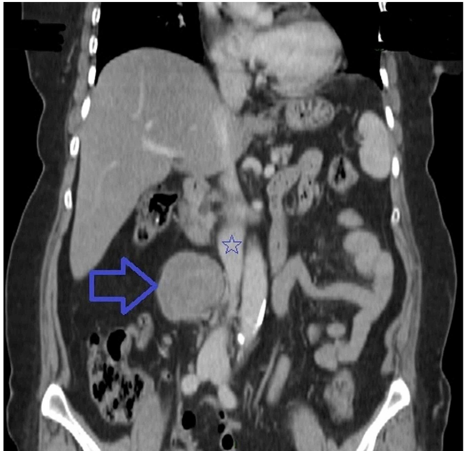
FIGURE 2: Coronal abdominal CT scan showing a retroperitoneal mass (blue arrow) located in the lateral and retrocaval area with intimate contact with the inferior vena cava (blue star).

Laboratory tests including tumor markers and urine catecholamine were normal. The patient underwent a laparotomy surgery, showing a bilobed mass connected to the intervertebral foramina, and making us suspect the possibility of schwannoma. Thus, a complete resection of the tumor was performed (Figure 3).