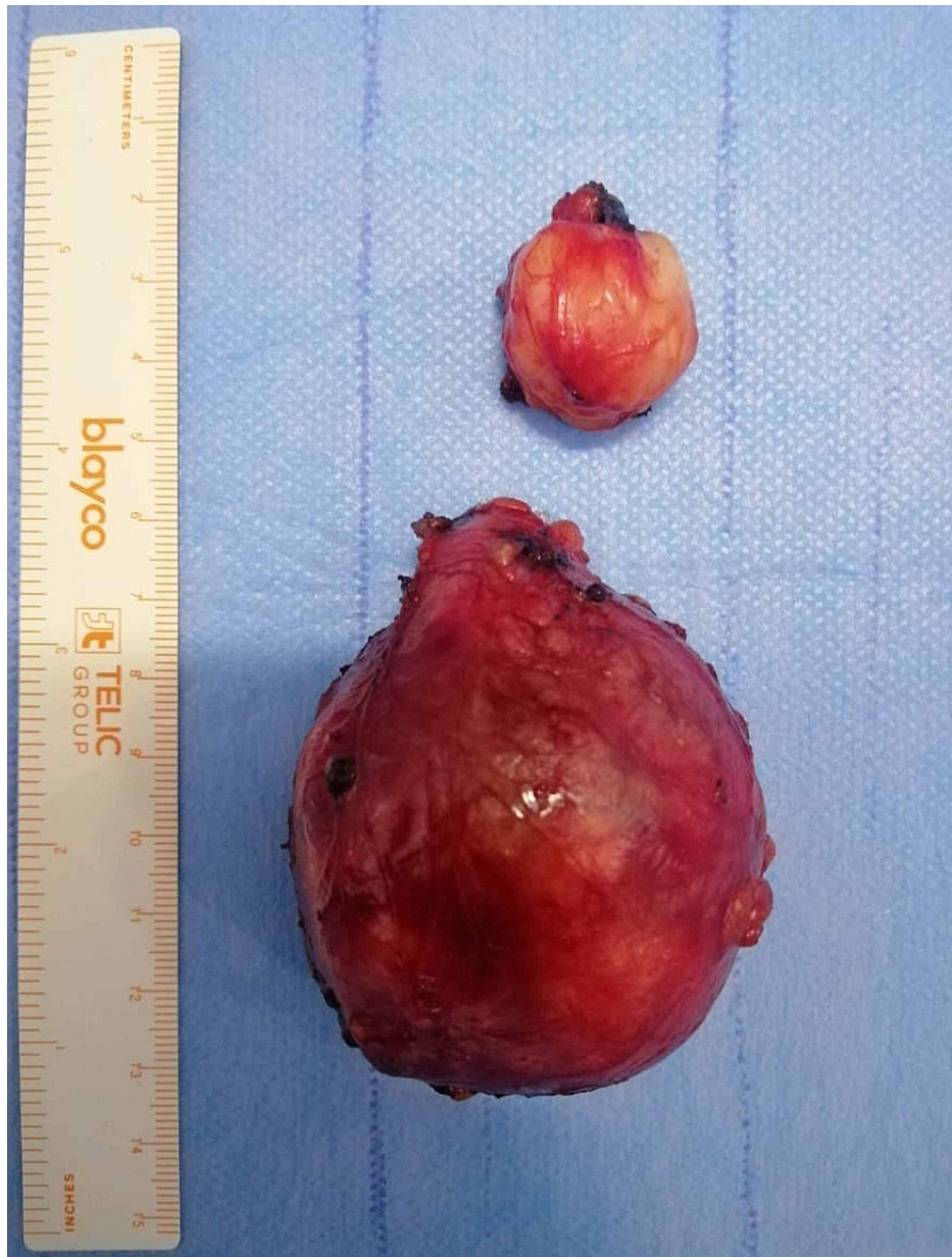
FIGURE 3: Image showing the resected mass.

The postoperative course was uneventful. Microscopic findings revealed the presence of spindle-shaped cells with a typical palisading pattern, arranged in short bundles of interlacing fascicles. The final pathologic diagnosis was a benign schwannoma. The patient experienced no recurrence over six months of follow-up