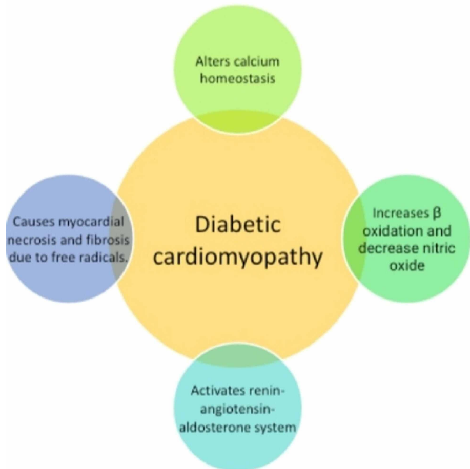
FIGURE 2: Pathophysiology of diabetic cardiomyopathy.

This figure summarizes four different pathophysiological changes due to diabetic cardiomyopathy in the