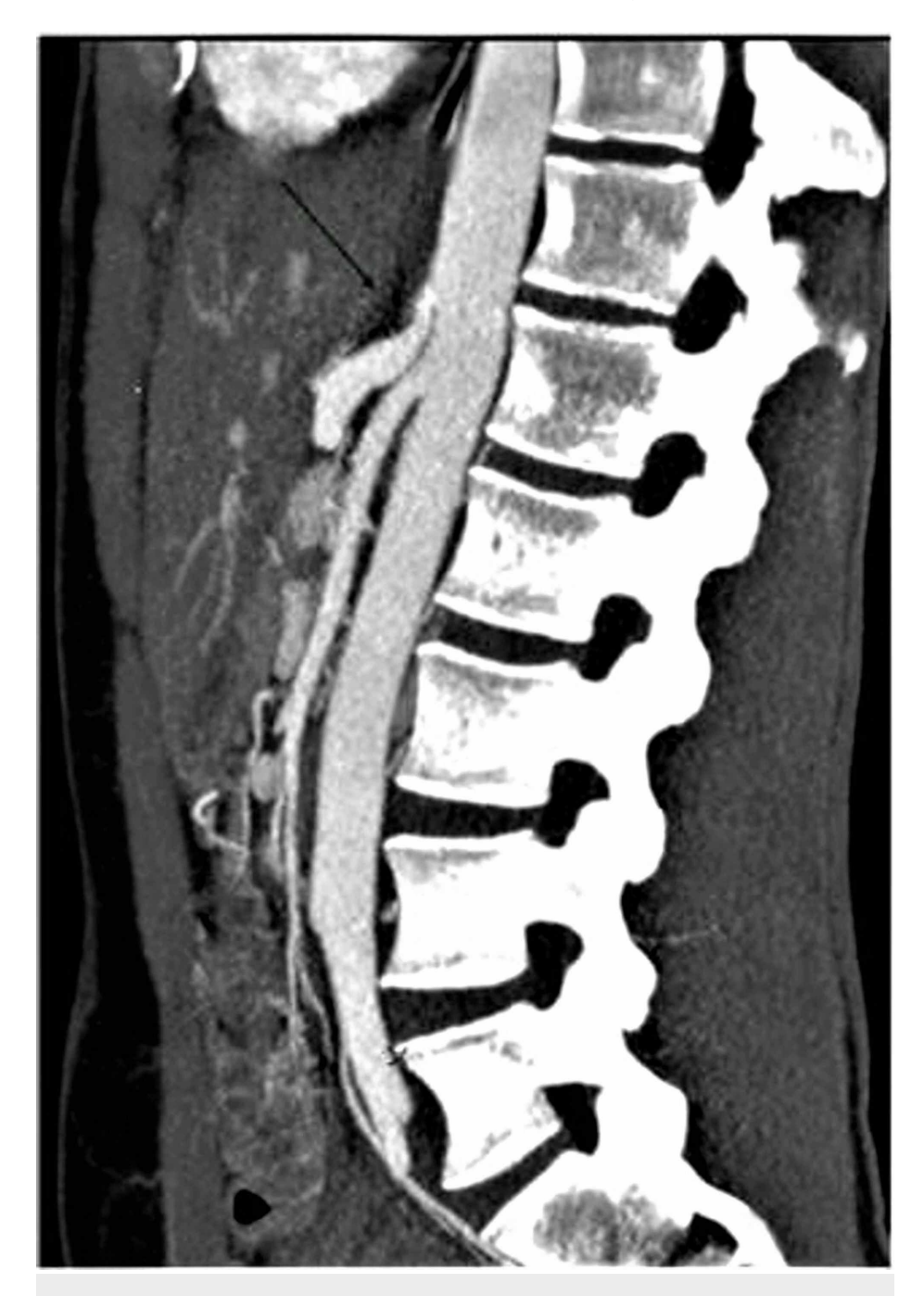
FIGURE 1: Lateral computerized tomography angiogram

trunk at its origin on expiration (Figure 2). The constriction was relieved on inspiratory film - findings most consistent with MALS (Figure 3). Surgical intervention was recommended to our patient. However, due to social and domestic reasons, she opted to consider laparoscopic celiac artery decompression at a later date.