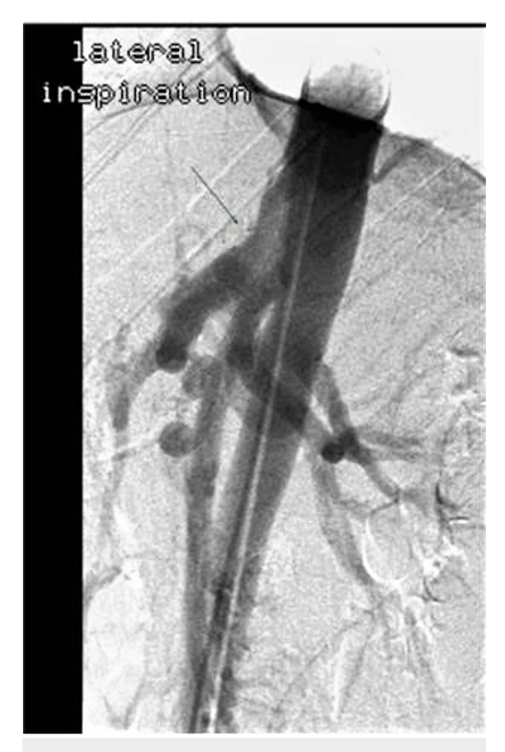
FIGURE 3: Inspiratory lateral aortic angiogram

The angiogram on inspiration depicting release of the anterior impression and constriction of the celiac artery.