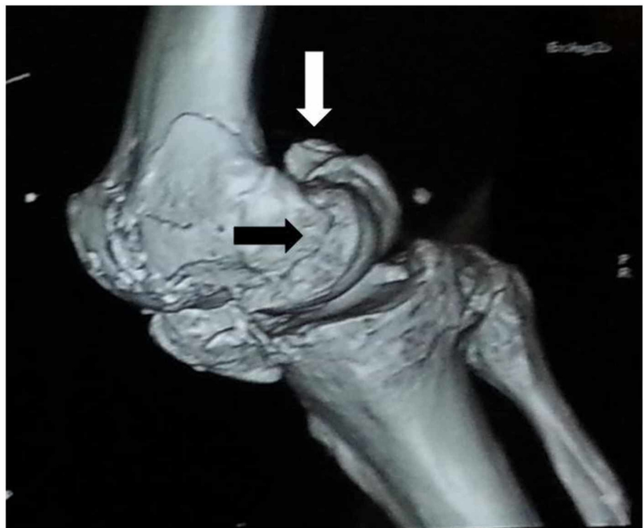
FIGURE 3: 3-D computed tomography showing bicondylar Hoffa's fracture: medial condyle (black arrow) and lateral condyle fracture (white arrow)

Magnetic resonance imaging can be used for the assessment of patellar tendon integrity during patellar tendon incarceration into Hoffa's fracture.