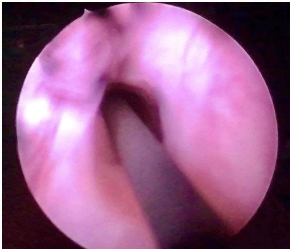
FIGURE 1: Cystoscopic view of the left ectopic ureteric orifice, inserting inferomedially into the bladder. The opening is dilated, with no efflux of urine. Passage of a guide wire led into the pelvis rather than the kidney, which was visualised by fluoroscopy.

Cystoscopy and retrograde pyelography were performed to delineate and confirm the suspected ureteric transection. On cystoscopy, the right ureteric opening was seen normally, with normal efflux. Two left ureteric openings were seen. A guide wire inserted through the inferior opening just proximal to the external sphincter seemed to pass into the pelvic cavity and not the kidney, and no efflux was visible from this orifice (Figure 1).