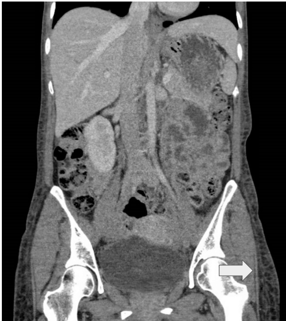
FIGURE 3: Contrasted computed tomography scan of the abdomen and pelvis

A bilateral small amount of pleural effusions, diffuse subcutaneous edema, and mild interlobular septal thickening in the visualized lung bases may be related to fluid overload. The arrow points to subcutaneous edema.