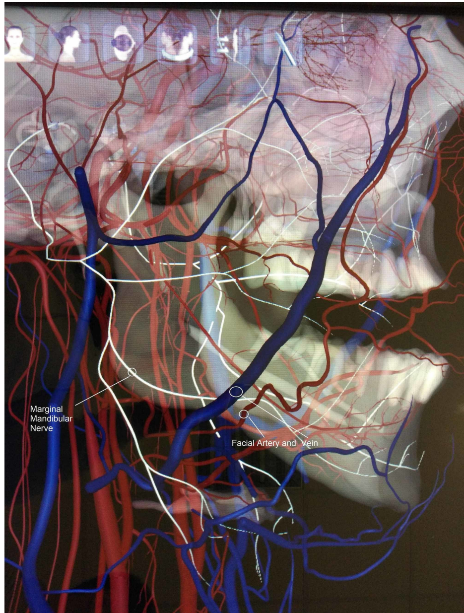
FIGURE 2: Lateral view of the single branch of the right marginal mandibular nerve, which runs deeper than the facial artery and vein