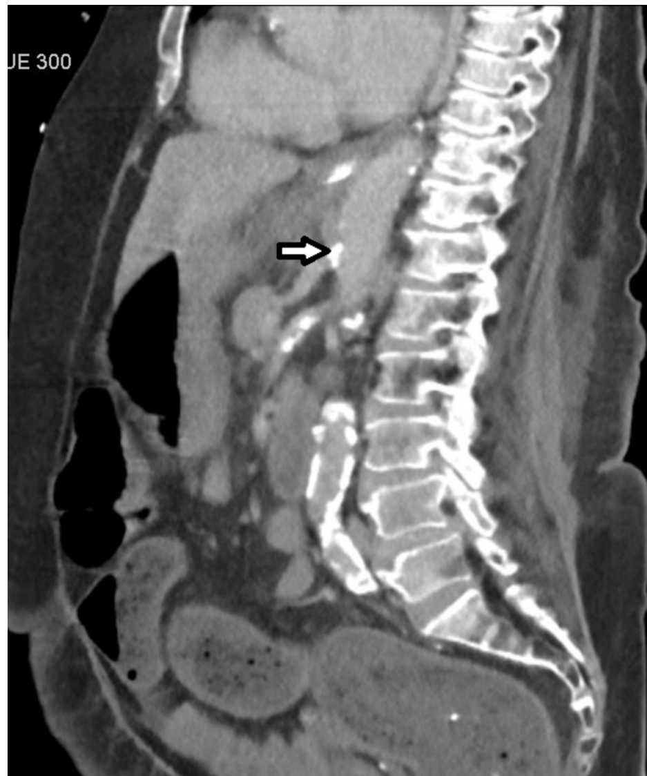
FIGURE 3: Atherosclerotic plaque within the celiac artery (arrow) and SMA causing high-grade stenosis