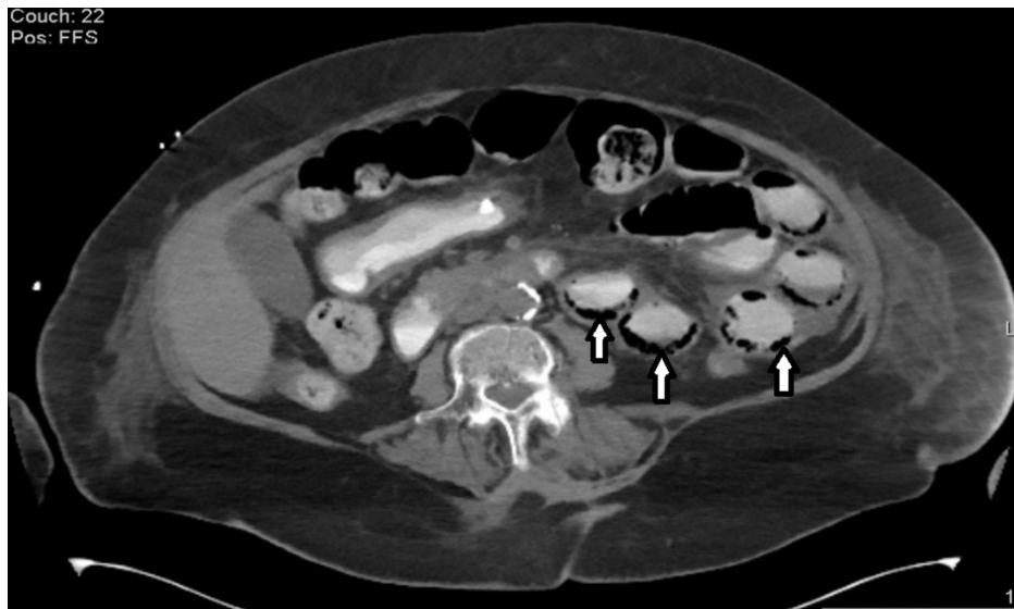
FIGURE 1: Pneumatosis intestinalis; air within the bowel wall (arrows)

Metronidazole intravenous (IV) was then started for the management of gas-forming organisms, which led to an immediate improvement in leukocytes from 24 K/uL to 8.6 K/uL. The patient developed melena and anemia (Hgb 6.4g/dl) afterwards. Esophagogastroduodenoscopy (EGD) revealed extensive shallow ischemic ulcers involving most of the anterior gastric wall and denuded duodenal mucosa (Figure 2).