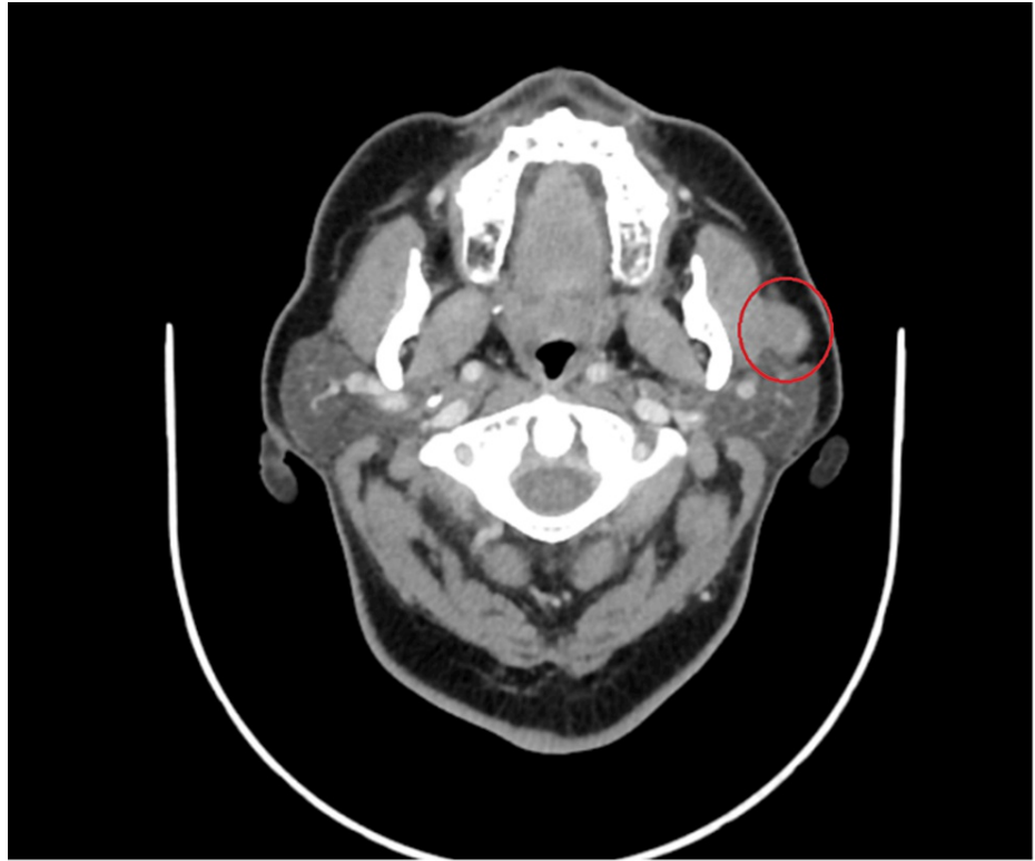
FIGURE 1: CT head and neck (axial section)

An enlarged, non-enhanced oval shaped left mandibular mass located superficial to and lying on the left masseter muscle measuring 1.2 cm with foci of calcification; minimal peripheral enhancing components.