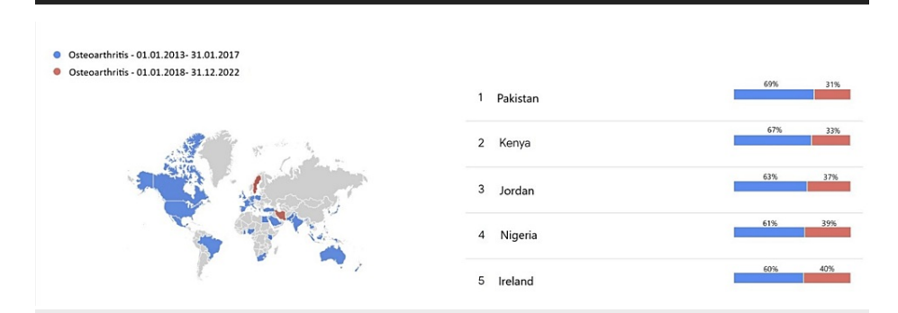
FIGURE 3: Distribution of searches for the term 'osteoarthritis' by years and countries.