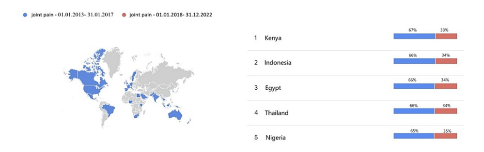
FIGURE 2: Distribution of searches for the term 'joint pain' by years and countries.