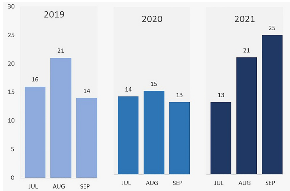
FIGURE 1: Monthly trends for hospital admissions between July and September of 2019, 2020, and 2021 in bar graph form. The x-axis represents the month and year of admission, and the y-axis represents the number of admitted patients