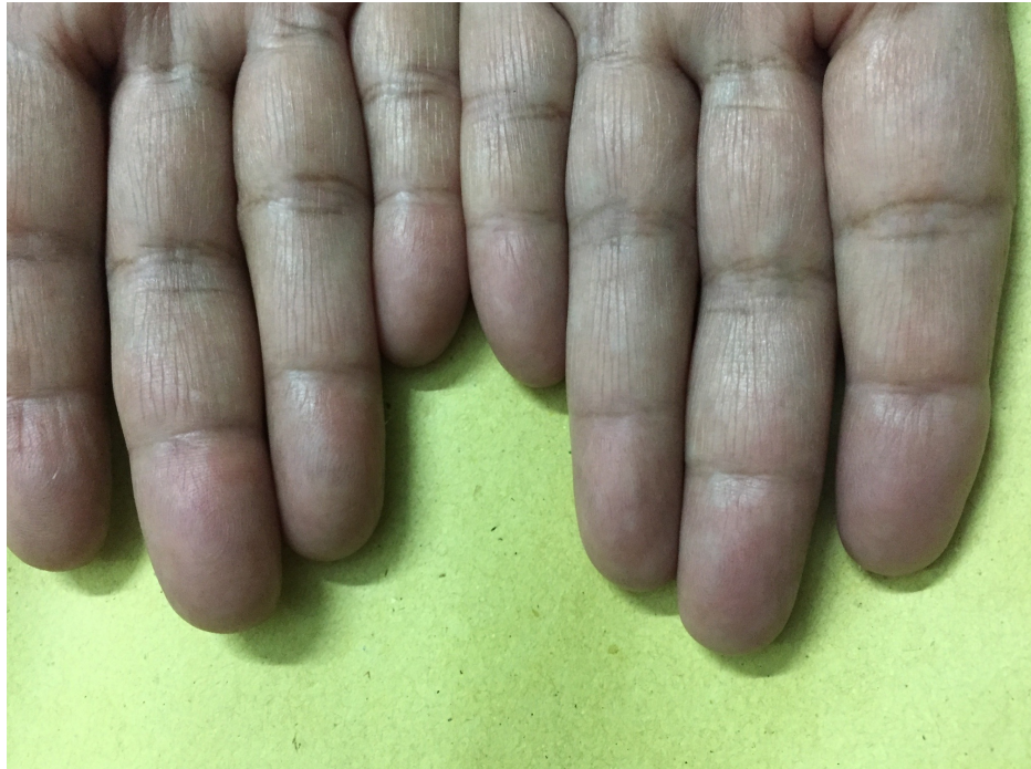
FIGURE 1: Acquired idiopathic adermatoglyphia in a 59-year-old female patient showing fingers of both hands

This woman visited the dermatology department in July 2016 for medical evaluation. She realized the loss of her fingerprints when she was unable to renew her national identity card, requiring her to be ten-printed (i.e., all fingers and thumbs of both hands were scanned/printed). Except for hypertension well-controlled with medication, her past medical history, physical exam, and laboratory reports failed to identify any probable cause of her findings. A detailed physical exam revealed marked effacement of ridges, involving fingers of both hands.