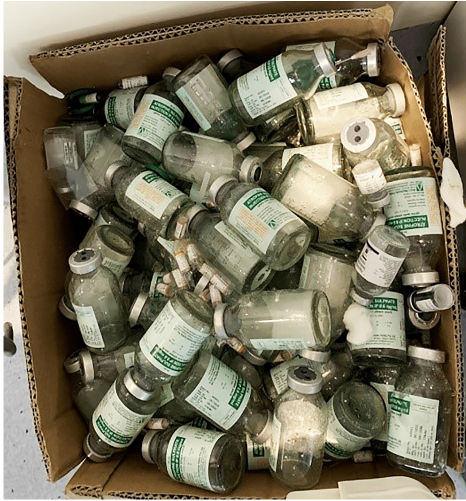
FIGURE 1: Total vials of atropine administered over 15 days which was an astounding dose of 1500ml