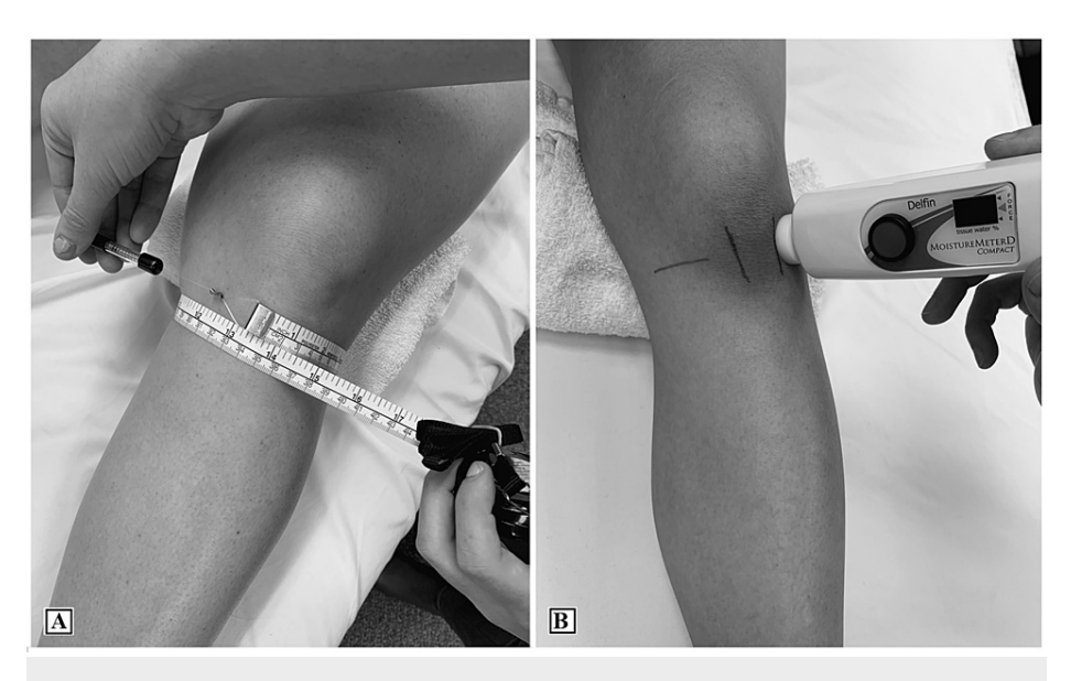
FIGURE 1: The measurement methods: (A) Tape measurement of the knee girth. (B) TDC measure of the knee local tissue water content

Knee girth was measured using a Gullick tape (FitnessMartW, Gays Mills, WI, USA). This tension-gauge tape measure conforms to the body and features a spring that provides consistent loading tension [5,7]. The tape measure (Figure 1A ) was placed around the joint line, and the value was recorded to the nearest 0.1 cm. A tension gauge tape measure has been reported to be more reliable than a standard tape measure in recording limb girth [7].