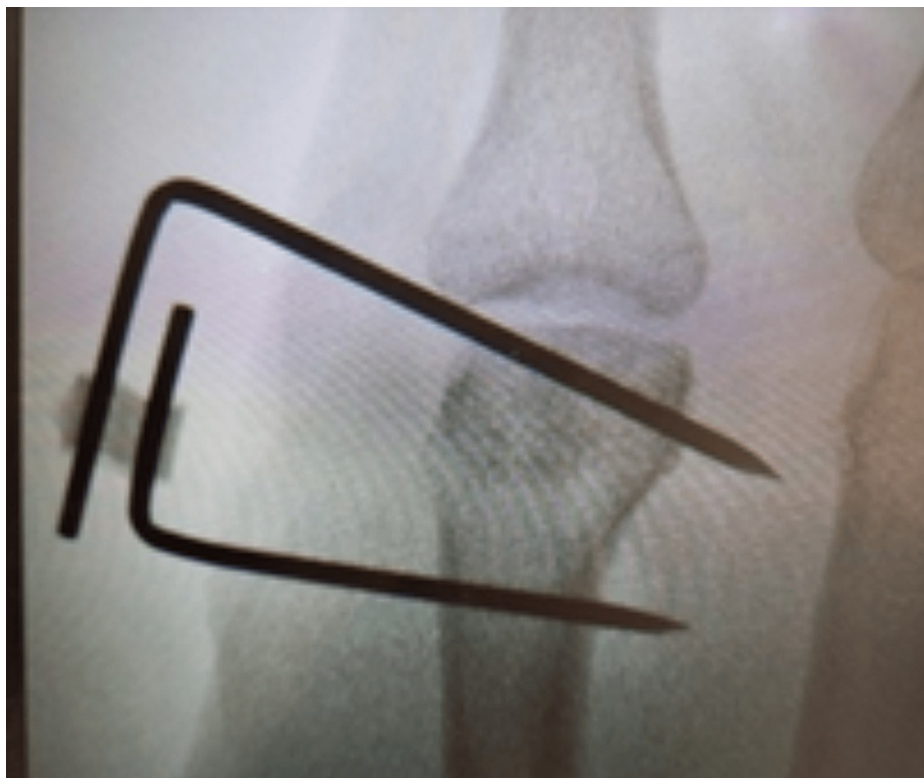
FIGURE 5: An intra-operative radiograph detailing the fixation device.

As this is a recent case, an accurate conclusion cannot yet be obtained as to the patient's overall recovery. Despite this the patient reported that they were progressing well with minimal stiffness at an appointment to remove the fixator. Radiographs following the removal of the fixator can be seen in Figures 6, 7. It is worth noting that retrospective consent was gained from the patient's parents immediately following the operation as the complex nature of the fixation only became apparent during the surgery.