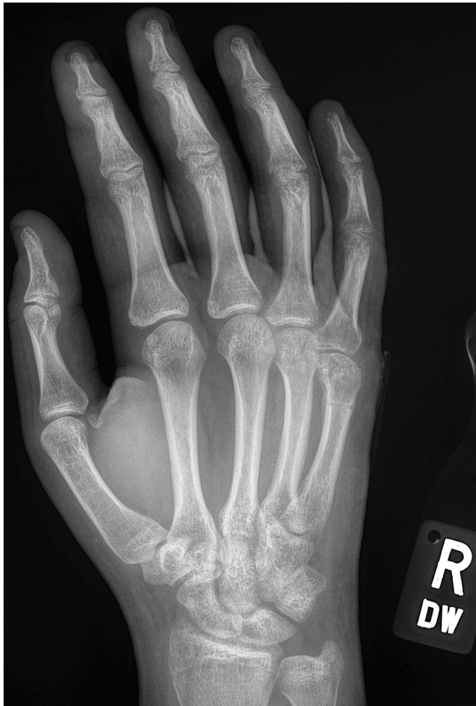
FIGURE 6: The patient's posteroanterior radiograph immediately following removal of the fixator.