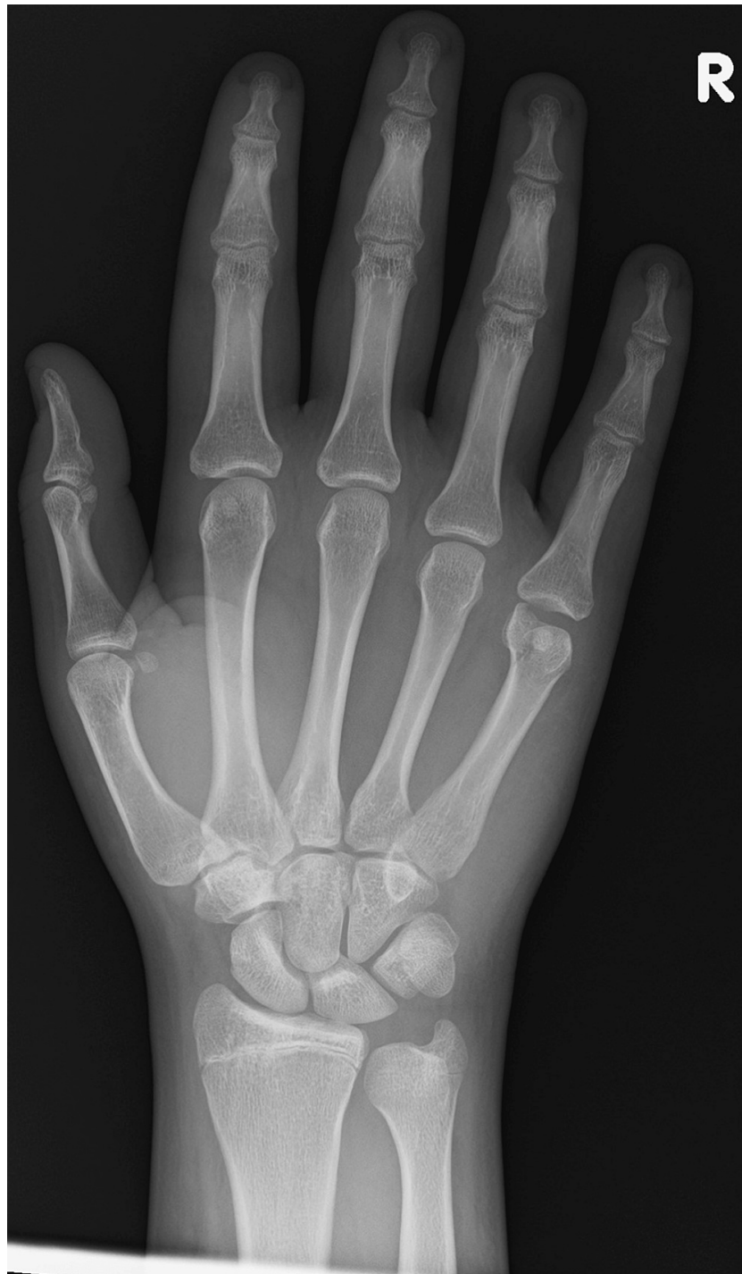
FIGURE 1: The patient's posteroanterior radiograph taken on presentation to the emergency department.