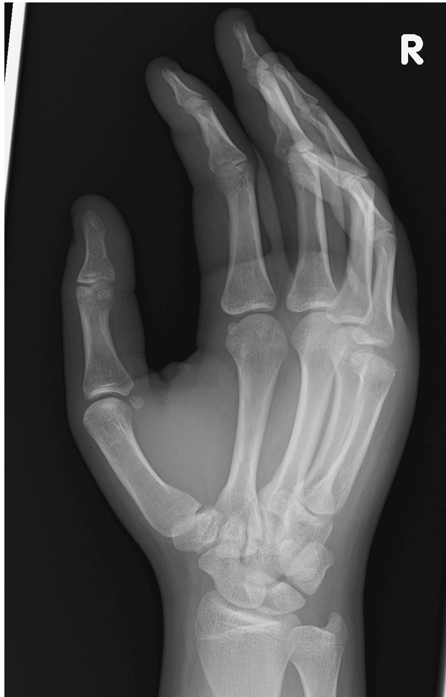
FIGURE 2: The patient's oblique radiograph taken on presentation to the emergency department.

During the fracture clinic follow-up appointment, both conservative and surgical treatment options were discussed including the risks and benefits of specific options with the patient. The main fragment had a 3-4mm impacted depression creating a cavity with a subsequent loss of bone stock, meaning a headless screw fixation was not viable. Stable fracture fixation was subsequently achieved with an HK fixator (AREX, Palaiseau, France), as can be seen in Figures 3-5.