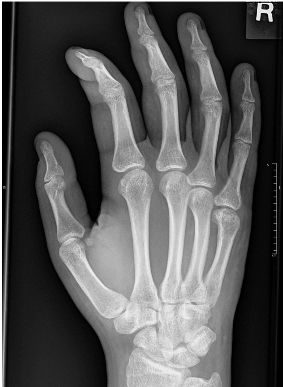
FIGURE 7: The patient's radiograph taken 12 weeks following removal of the fixator.