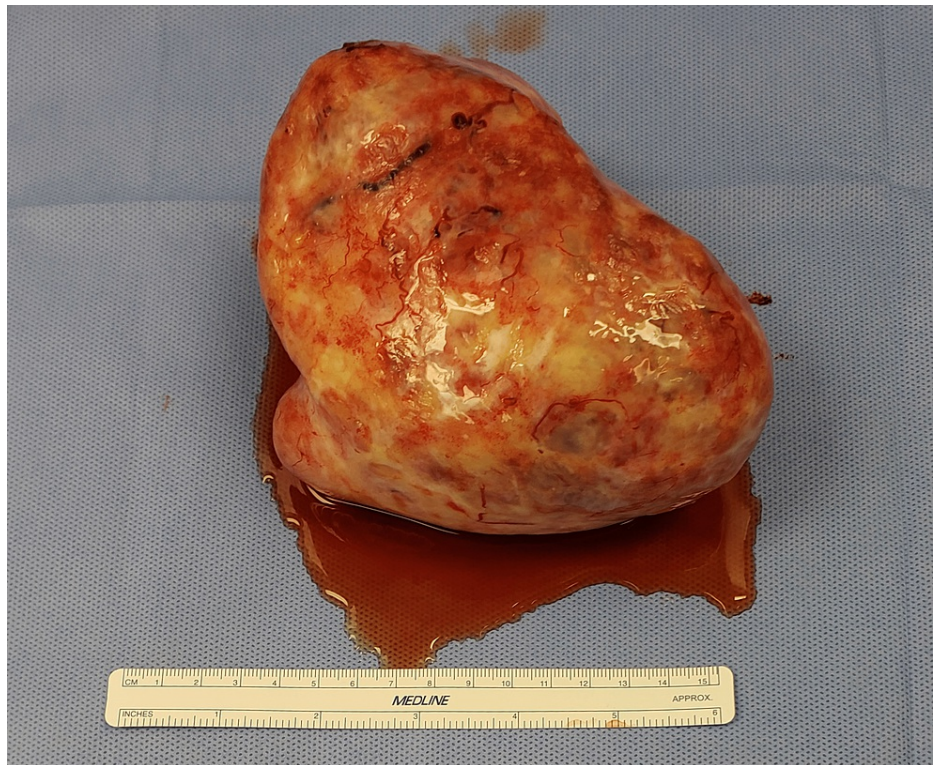
FIGURE 1: Torsed ovarian fibroma.