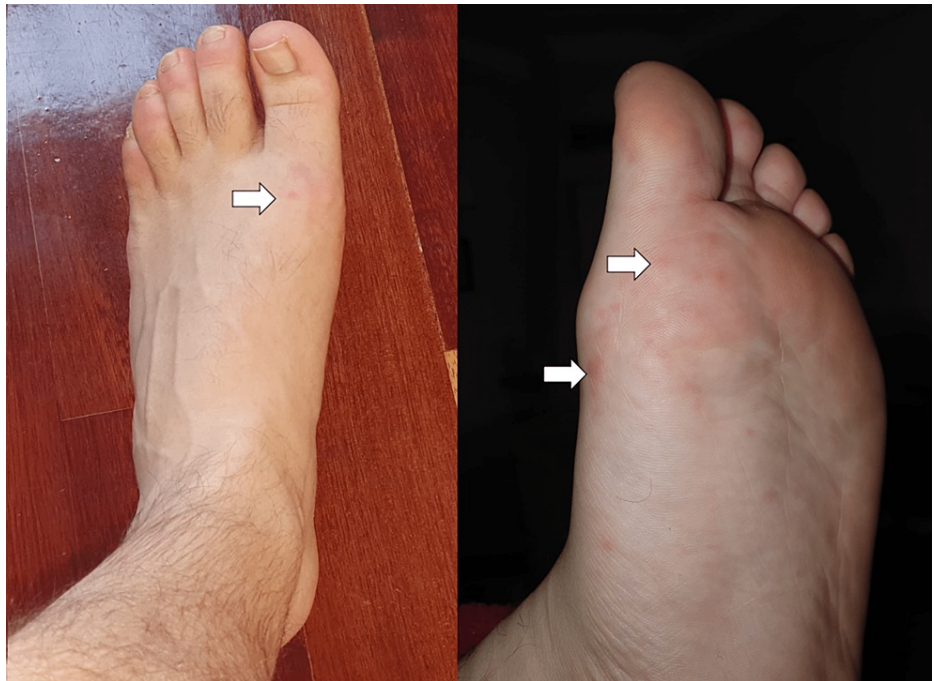
FIGURE 2: Macular lesions on the feet