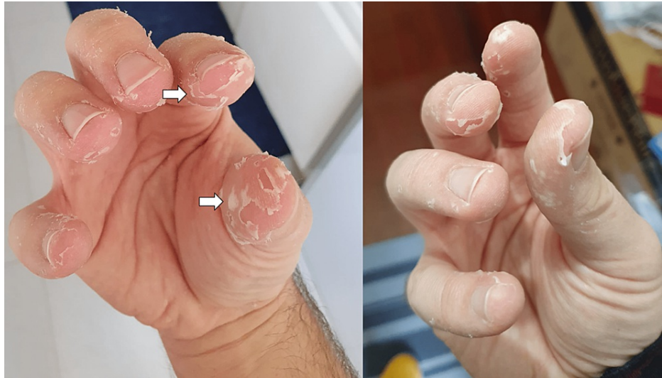
FIGURE 6: Skin desquamation in distal extremities of all fingers