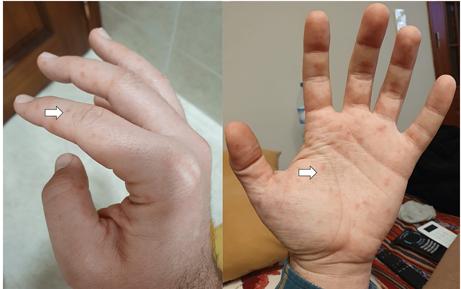
FIGURE 1: Macular lesions on the hands