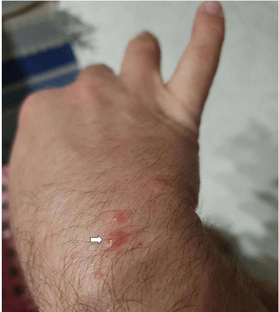
FIGURE 4: Bulla (dorsum of the hand)