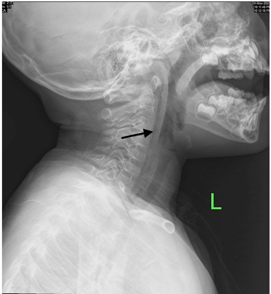
FIGURE 1: Lateral soft tissue radiography of the neck demonstrates a linear radiolucent line representing air in the retropharyngeal space

The patient was admitted to the hospital and managed conservatively with analgesia and intravenous prophylactic antibiotic for three days. A series of lateral soft tissue radiographs of the neck were obtained during his hospital stay (Figure 2).