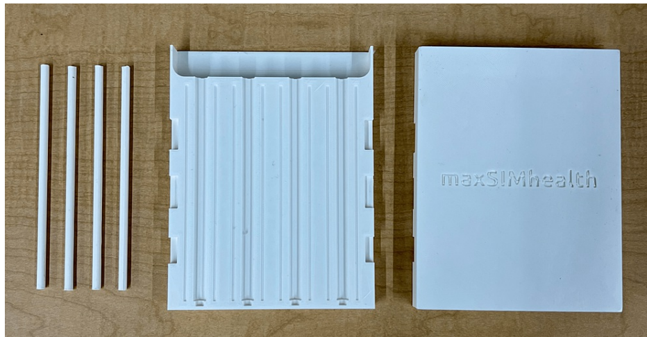
FIGURE 1: 3D-printed mold for the BDA simulator.

3D, three-dimensional; BDA, bile duct anastomosis