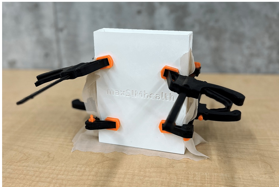
FIGURE 2: Assembled 3D-printed mold for the BDA simulator.

To produce the BDA simulator, first, the mold had to be assembled correctly so that the power mesh could be included before the silicone was poured into it. The power mesh was necessary for increasing the durability of the bile duct. First, all 3D-printed components were sprayed with Ease Release 200, a release agent, to allow for easy silicone removal and set to dry for 15 minutes. Once dried, one outer half of the mold was placed down on a stable surface facing up, then a rectangle of power mesh measuring 14 cm × 18 cm was placed on top so that the power mesh was lined up with the top part where the bile ducts would start, just at the bottom of the funnel. The four rods were lined up and placed within the tunnels of the outer half of the mold, on top of the power mesh. Another 14 cm × 18 cm layer of power mesh was added to cover the rods. To close the mold, the other outer half of the mold was lined up and placed on top to secure the two layers of the power mesh and the rods. To ensure that the mold would remain closed, four clamps (two at the top and two at the bottom) were secured onto the mold to remain closed in a vertical position. The assembled mold is shown in Figure 2.