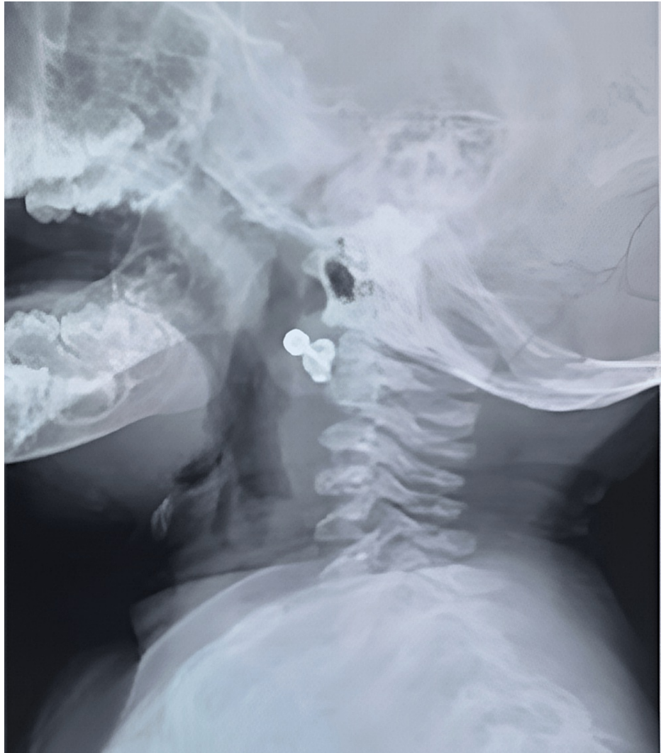
FIGURE 1: Lateral view neck X-ray

We decided to do a fiberoptic scope on the patient and accidentally found a foreign body glass between the vocal cord and planned to remove it in the operating room by bronchoscope. Intraoperatively by bronchoscope, we saw a piece of glass trapped between the vocal cords, with no damage to vocal cords or surrounding structures. There was evidence of mild reactive granulation tissue at the site of foreign body impaction (Figure 2).