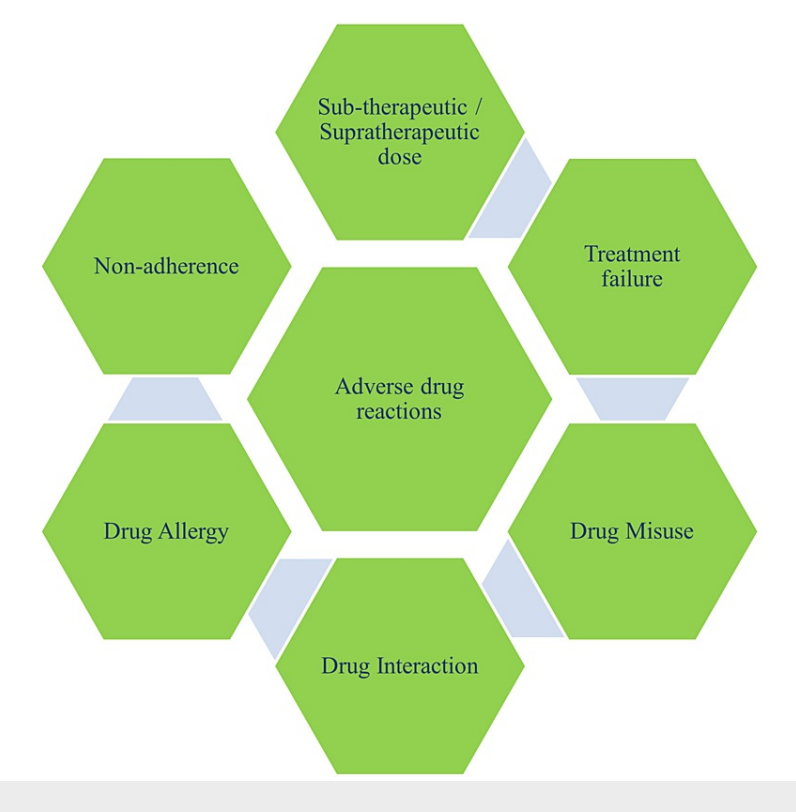
FIGURE 2: Contributors to adverse drug events

When prescribing a drug, the doctor should look for possible drug-drug interactions. The dosing needs to be adjusted based on age and creatinine clearance levels. Patients should be warned about the effects of likely non-adherence and how it should be dealt with. Computerized physician order entry has clinical decision support systems that help avoid unnecessary ADR when a patient is on multiple drugs, thereby preventing medication error. Educational programs may have a limited role in reducing medication errors. A list of allergies must be stored in a repository to prevent drug allergies. These systems will duly work if we understand the nature of mistakes and try to improve them [27].