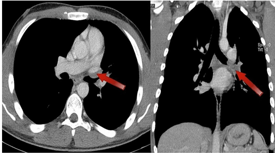
FIGURE 2: Axial and coronal images with contrast from March 27, 2020 (two months after initiation of therapy)

Demonstrates a significant improvement in the mass, now measuring 2.5 cm x 0.9 cm (indicated by red arrows).