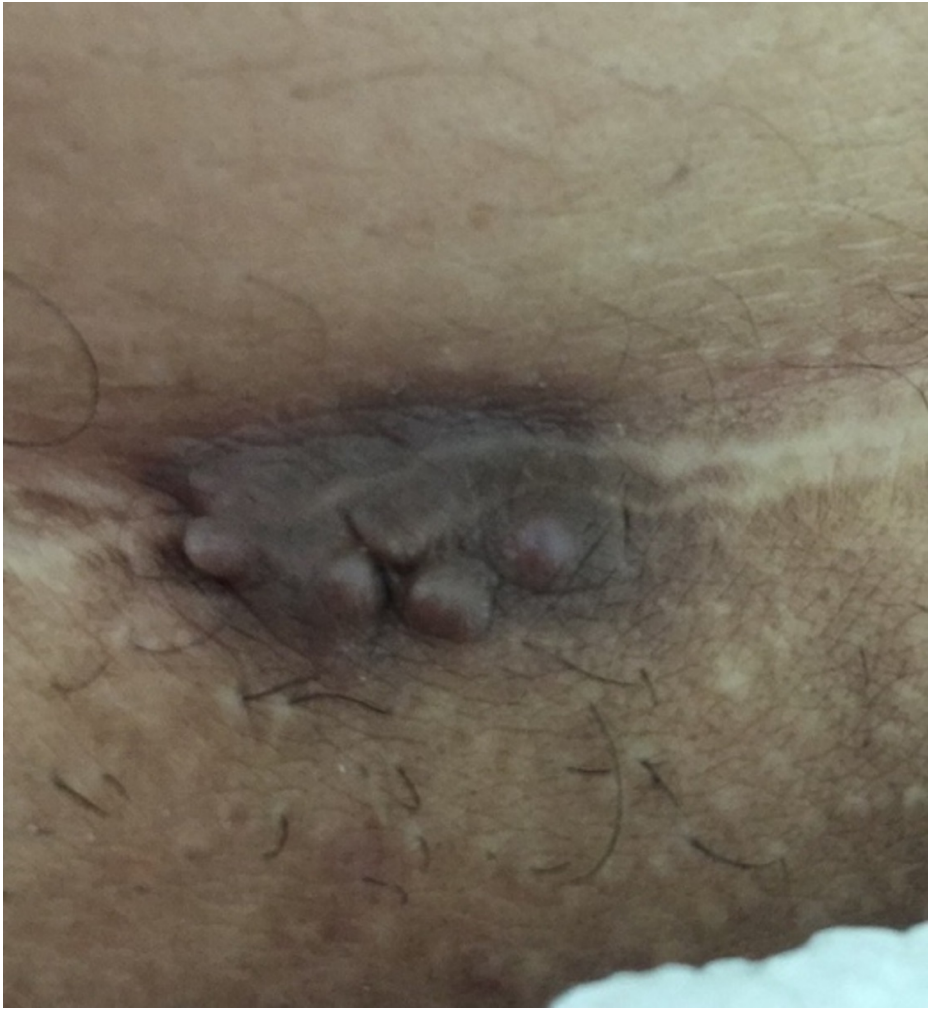
FIGURE 1: Endometrioma measuring 2 cm x 3 cm located on the lateral aspect of the Pfannenstiel incision with tiny multiple orifices protruding on the skin

Sonography and Doppler examinations of the abdominal wall soft tissue revealed a heterogeneous hypoechoic mass with little vasculature (Figure 2).