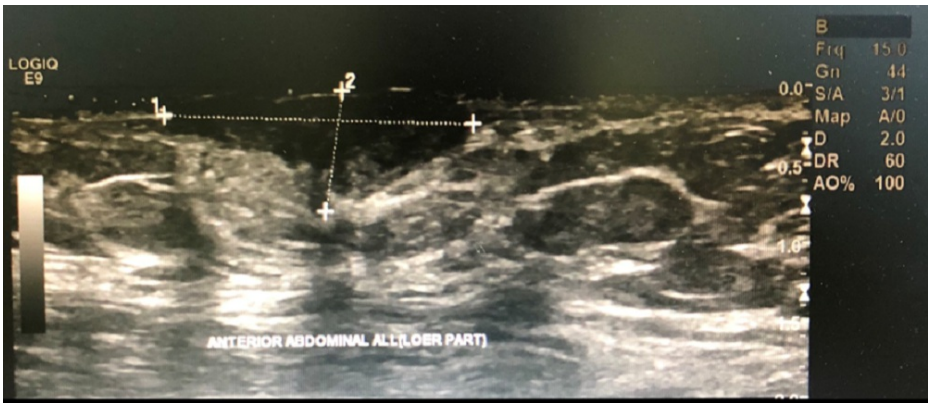
FIGURE 2: Abdominal wall soft tissue revealed a heterogeneous hypoechoic mass with few vasculatures

Sonography and Doppler examinations of the abdominal wall soft tissue revealed a heterogeneous hypoechoic mass with little vasculature (Figure 2).