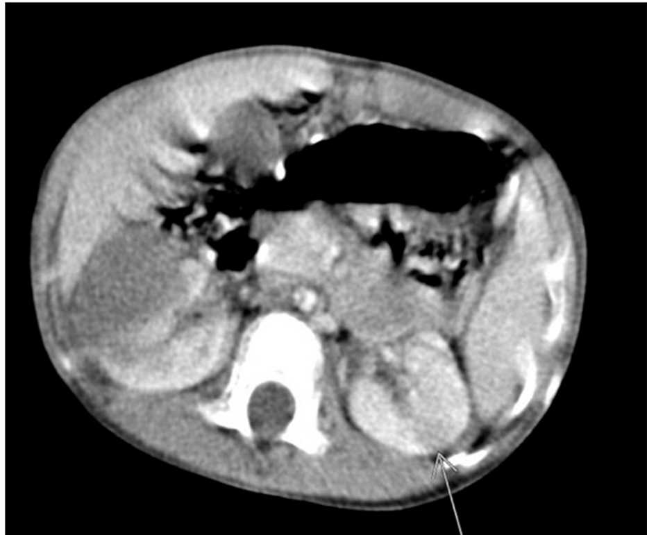
FIGURE 2: CT scan after six cycles of chemotherapy showed a marked reduction in the right renal tumor and minimal changes in the left tumor (arrow indicates mass in the left kidney).