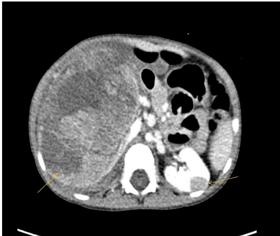
FIGURE 1: Huge renal mass in the right kidney and small nodules in the mid-left kidney (arrows).

USG-guided biopsy samples were taken from both tumors. Both samples confirmed the histology of Wilms' tumor. Following confirmation, NACT was started for six weeks with vincristine, dactinomycin, and doxorubicin.